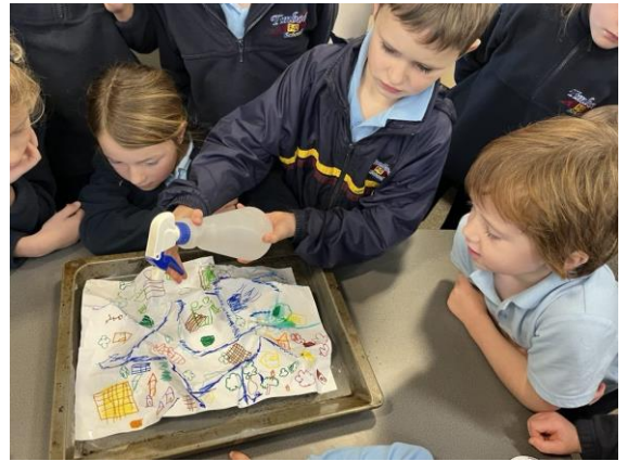
Year 1/2 students learn how catchments work.

“Under guidance from the art teacher they brought the Rainbow Serpent to life, just like the Curdies River after a good soak.”