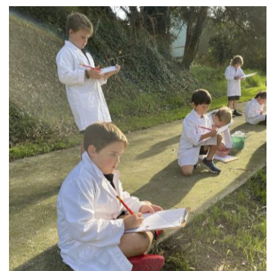
Year 1/2 students at Curdies River tributary, Power Creek